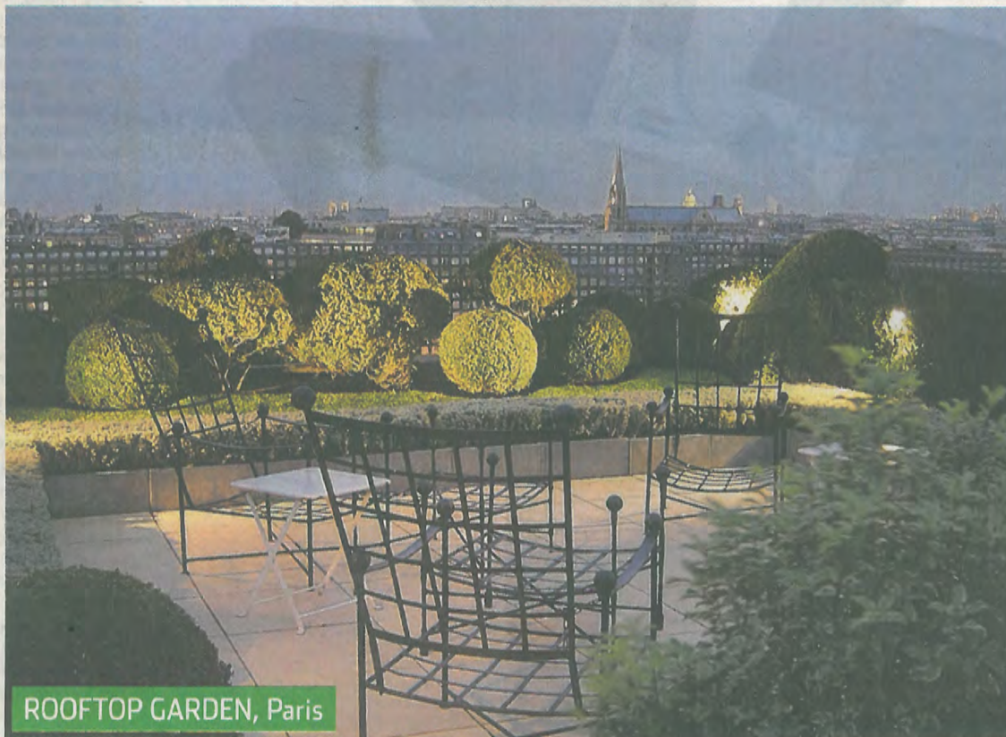
ROOFTOP GARDEN, Paris

Here, a look at three of his best-known private gardens.