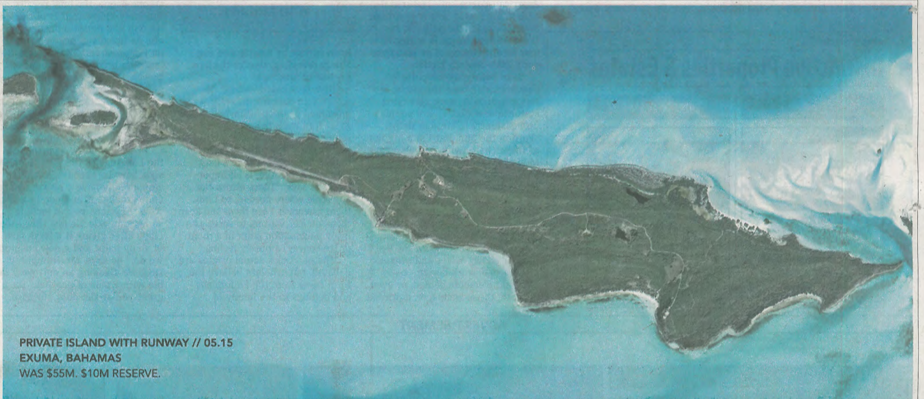
PRIVATE ISLAND WITH RUNWAY // 05.15 EXUMA, BAHAMAS WAS $55M. $10M RESERVE.