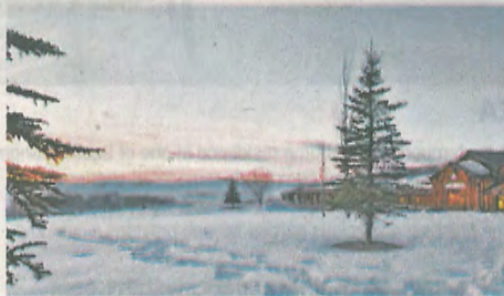
CALGARY // 05.08 2 PROPERTIES. 1 WITHOUT RESERVE.