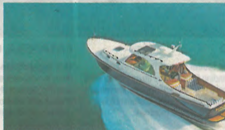
GRAND BAHAMA // 05.15 2 PROPERTIES. 1 WITHOUT RESERVE.