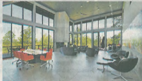
ARIZONA // 05.21 WAS $2.995. WITHOUT RESERVE.