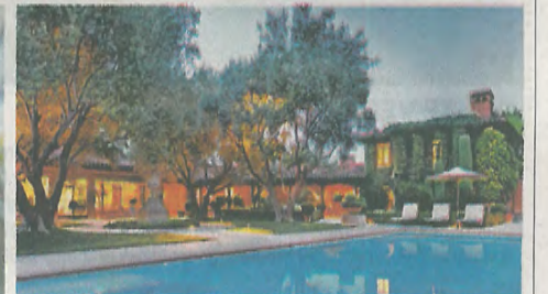
CALIFORNIA // 05.22 WAS $22.5M. WITHOUT RESERVE.

CONCIERGEAUCTIONS.COM // 212.257.4928 // +44.7747.603.287